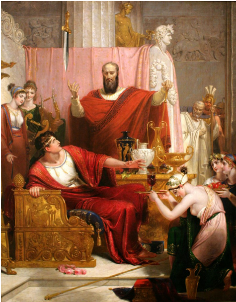
Damocles Sword - Click to Enlarge (look closely to see sword)

Vengeance is Mine, and retribution (recompense) - NET = "will get revenge and pay them back at the time their foot slips." Mark it down that divine judgment may be delayed but it will not be indefinitely deferred! Retribution (shillem - only OT use) is translated in Lxx with antapodidomi meaning to give back in return for something received (in this case payback for sin). The Hebrew verb ( shillem ) speaks of a deserved punishment, in the sense of a repayment for whatever wrong was done by a person. The point is that the punishment is deserved and it is ultimately only God Who has the right to avenge the wrongdoers, giving them what they deserve.