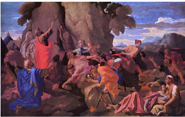
Moses Strikes the Rock

Isaiah 28:16 Therefore thus says the Lord GOD, "Behold, I am laying in Zion a stone, a tested stone, A costly cornerstone for the foundation, firmly placed. He who believes in it will not be disturbed.